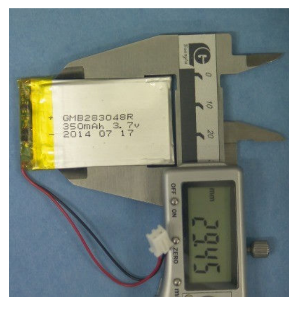
Authenticate the photo on original report only