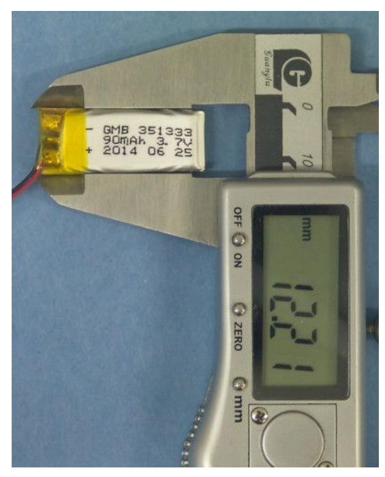
Authenticate the photo on original report only